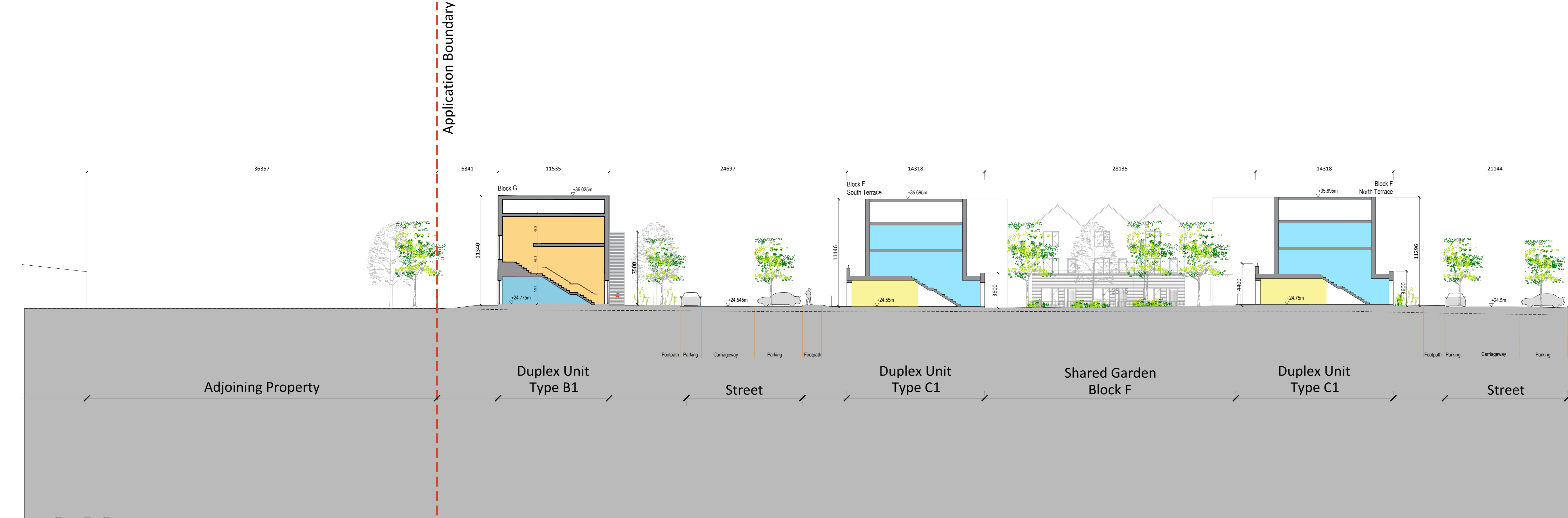
Section AA_01 Esc 1:200